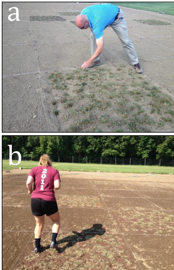
Figure 1. a) 'Latitude 36' bermudagrass was established via sprigs while two other varieties, 'Yukon' and 'Rivera' were seeded. b) Sprigs were then cleated into the soil and topdressed with a fine layer of soil to assist with root development.

season study consists of 'Supranova', supina bluegrass, 'Granite' Kentucky bluegrass, 'Mustang 4' tall fescue and 'Fiesta 4' (seeded on May 30, 2013).