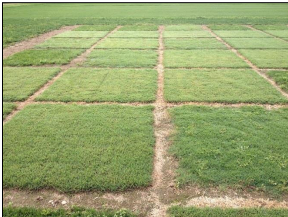
Figure 3. Bermudagrass plots were completely covered within a few weeks of seeding/sprigging. This rapid growth rate competed well with crabgrass and broadleaf weed pressure.

All varieties of bermudagrass were extremely aggressive. Once seeded/sprigged, establishment was rapid and turfgrass cover became dense quickly.