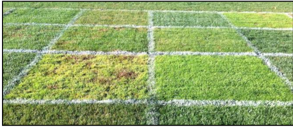
Figure 5. Supina bluegrass plots showed increased weed pressure and decreased color without applications of pesticides or crumb rubber.

establishment phase. However, the warm-season plots required no fungicide or herbicide applications.