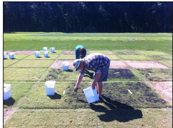
Figure 2. In September 2013, crumb rubber was applied to cool-season turfgrasses at a rate of 0.75 inch per plot and to the warm-season bermudagrass plots at a rate of 0.5 inch per plot.

The third factor, management has two levels; 1) minimal pesticides applied, and 2) no pesticides and is the same for both studies. The cool-season, minimal pesticide treatments received Tupersan 470 granules at a rate of 3lbs/1000ft 2 at seeding for pre-emergent crabgrass control. SpeedZone (5pts/acre) and Drive 75 DF (1lb/acre) were applied to the minimal pesticide plots of each study on 6 August for post-emergent control of crabgrass and broadleaf weeds. The cool-season study received an application of Compass 50WDG (0.25 oz/1000ft 2 ) on 15 June to all plots as a curative for pythium foliar blight. Heritage TL (1 fl oz/1000ft 2 ) and Daconil Ultrex (3.2 oz/1000ft 2 ) were applied on 19 September to the cool-season minimal pesticide plots to control gray leaf spot. The warm-season study required no fungicide or herbicide applications during the establishment phase. Acelepryn G (1.15lbs/1000ft 2 ) was applied on 19 August as a preventative insecticide treatment to the minimal pesticide plots to both the cool and warm-season studies.